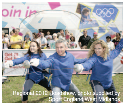
Regional 2012 Roadshow

The Physical Activity Network West Midlands (PAN-WM), the Regional Health Partnership and the West Midlands Leadership Group for the 2012 Games are collaborating to develop a plan to ensure that the West Midlands will capitalise on London hosting the 2012 Olympic and Paralympic Games. The initial stages of this development saw the West Midlands lead the commissioning of a systematic review of the evidence base for developing a physical activity and health legacy from the London 2012 Olympic and Paralympic Games which will be published in the next few weeks.